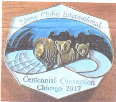
Three dimensional pin