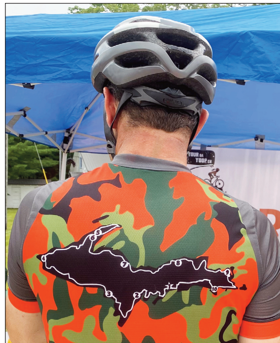
Left: Support team at the Porkies! Above: TDY shirts displayed a map of the TDY stops on the back.