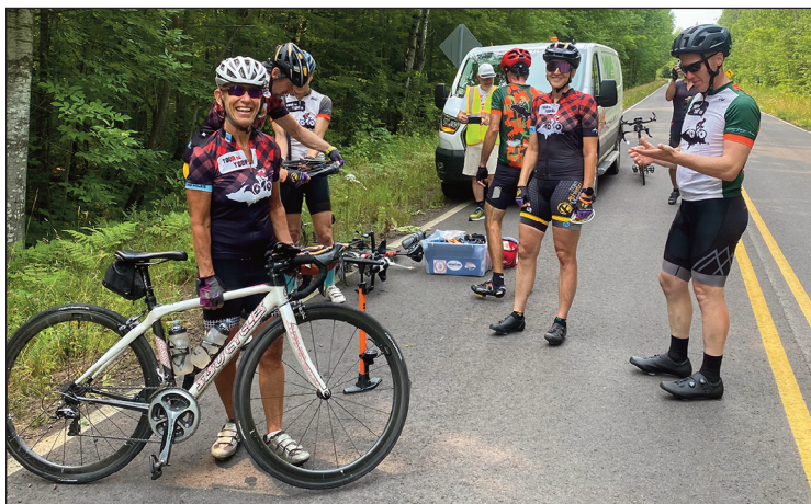
Left: Support staff to the rescue!