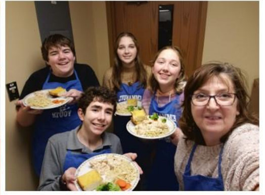
Our Ignite youth honed their cooking skills and made chicken fettuccini and apple pie. It was delicious!