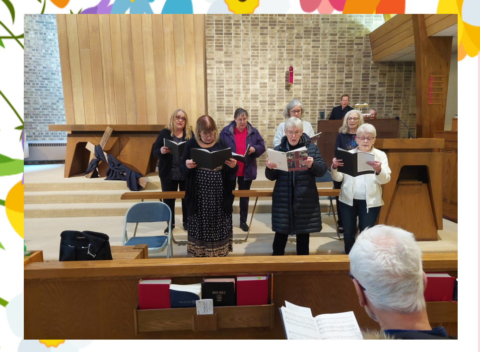
Maundy Thursday Choir Practice