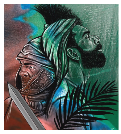
"Which parade would you follow? Jesus or Pilate?"