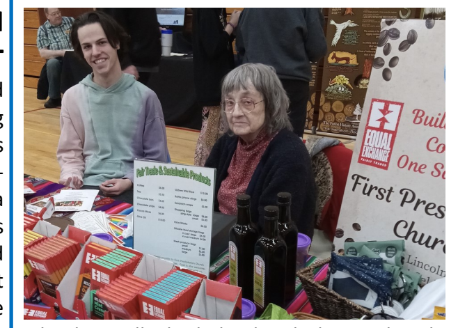
Thanks to all who helped with the FPC booth at the Marshfield Area Cultural Fair. Sales of Equal Exchange items totaled over $400!

product drive collected paper products, cleaning supplies, and craft items for Companion Day Services and Marshfield Area Respite Care. Eight boxes of supplies were delivered on March 7, 2023, and not a moment too soon. The bath tissue went straight from the box to the bath-