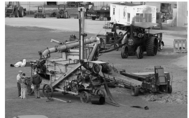
Threshing and Baling Demonstrations

Exhibitor Online Registration at www.UPSteamAndGasEngine.org