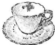
Mother's Day Tea

The Annual Mother's Day Tea is planned for May 12th at 1:00pm. There will be more information to follow.