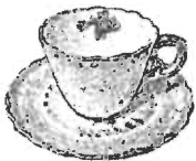
Mother's Day Tea