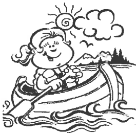
Send a Kid to Camp