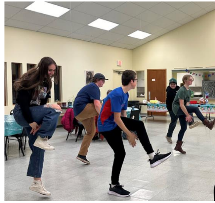
Some of the youth/mentors enjoying the New Year's Eve Party.